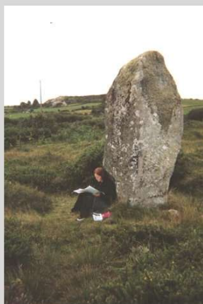
Menhir on the Moor: